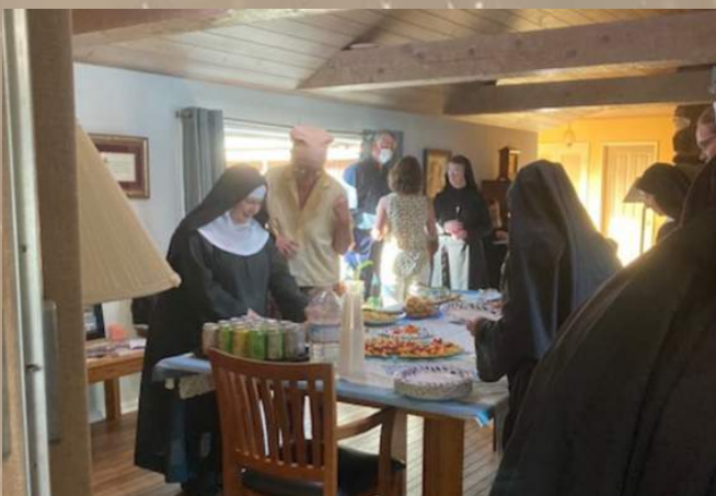
Openhouse at the Convent