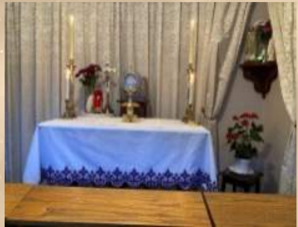
The Chapel in our new Convent