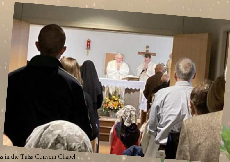
Mass in the Tulsa Convent Chapel, with the crowd spilling into the hallway. We were elbow- to-elbow, and everyone had the opportunity for confession following Mass.