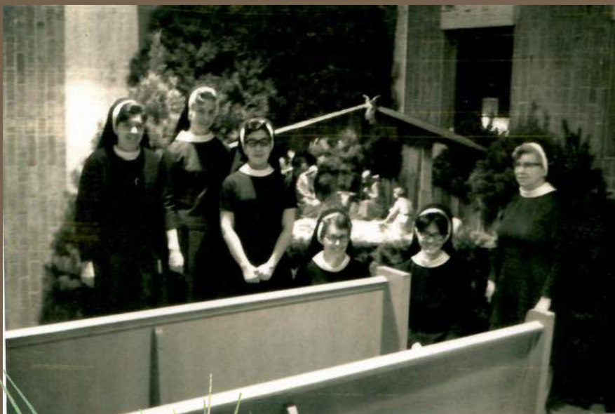
Christmas in our founding years