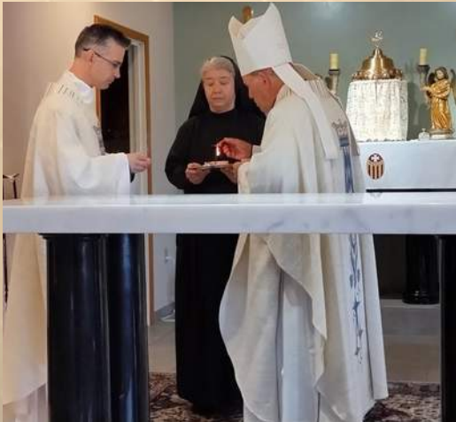
Preparing the relic of Pope St. John Paul II with wax and seal to be placed under the altar