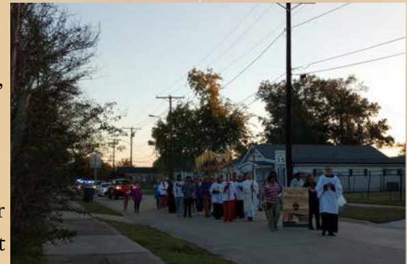
Our Lord approaches our Convent as the sun sets in Southwest Louisiana.