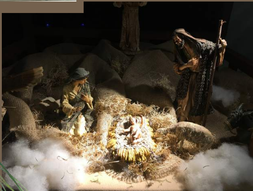
Crèche scene from our Motherhouse in Alma, Michigan