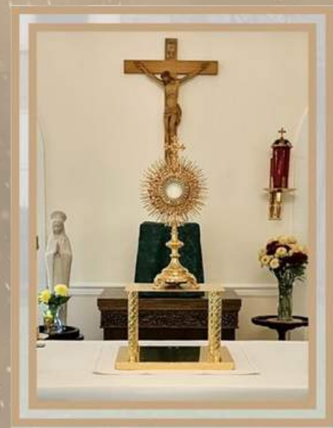
Our Chapel in Clinton

It is in the spirit of Venerable Mother Catherine McAuley to invite others into our home with great hospitality. We hope that those who join us will be caught up in our charism of mercy by experiencing the infinite mercy of Our Lord in the granting of a plenary indulgence and witnessing our joyful lives as Religious Sisters of Mercy. We are very grateful for the generosity of our benefactors who support us in our mission, especially with their prayers, and are thankful that we are able to invite them, and all who attend our Open House or join us at other times for prayer and repast, to be with us in this privileged year of celebration of our Institute.