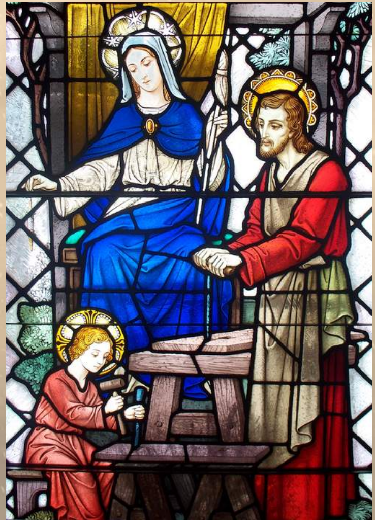
Stained glass from our Motherhouse Chapel in Alma, Michigan

Reliant on your abundant prayers, we will let you know of next steps.