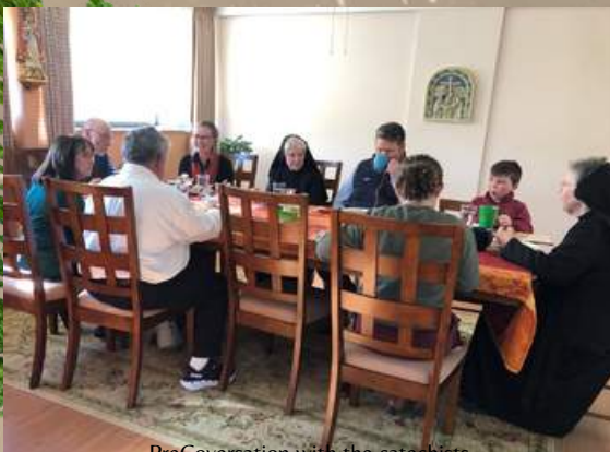
PreConversation with the catechists