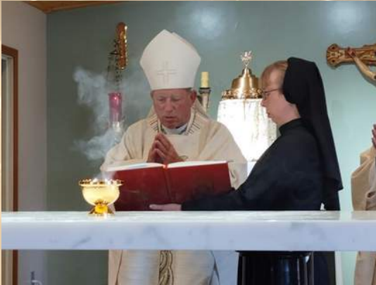
Burning of incense on the altar during the consecration