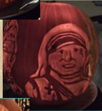
Mother Teresa with the Pietà on the side