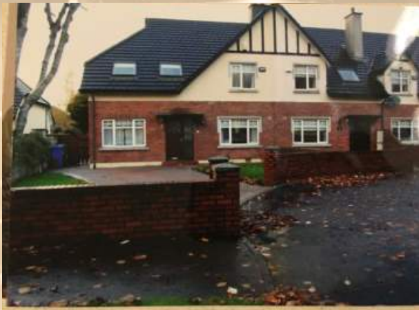
Our Convent in Limerick