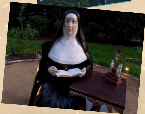
Top: Street library box, made and donated by the local Men's Shed