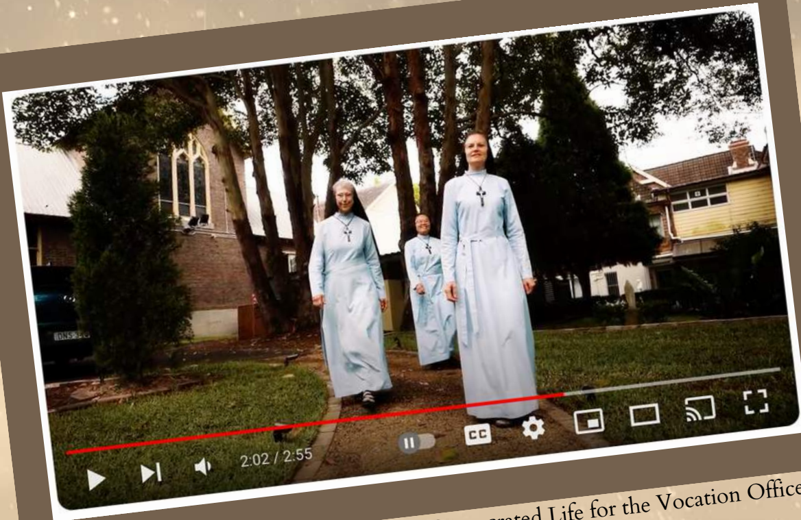
Video on Consecrated Life for the Vocation Office, Archdiocese of Sydney