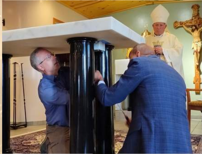
Placing the relic under the altar