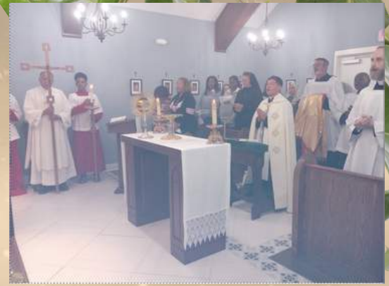
The crowd finishes singing "Holy God we praise Thy Name" with hearts full of gratitude for the gift of our faith, and enough incense to perfume the Chapel for a week!

We celebrated the Memorial of St. Martin de Porres with a Eucharistic procession, beginning at a local parish, the parish of the Immaculate Heart of Mary, carrying our Lord through the neighborhoods of North Lake Charles, ending in our Chapel. Around 40 people joined, many of whom were confirmandi from our African American parishes. We prepared a plethora of goodies, none of which was Cajun food, because we did not dare try to compete with the locals! Many stayed for the reception and spent time with our Lord in the Chapel. Celebrating with our people here in Lake Charles is a delight and a privilege! They just love our Lord and His Church, and they like to eat! The orzo salad was a hit and the recipe was shared many times!